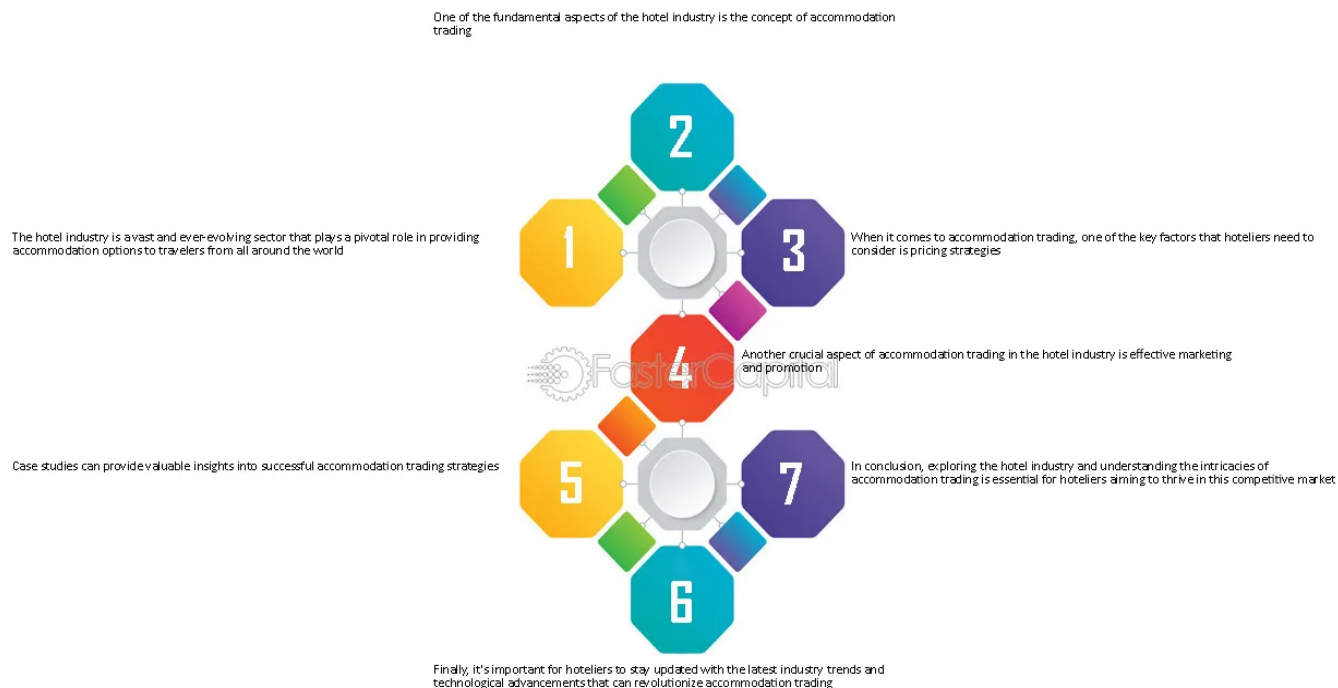
Figure 3. Exploring the hotel industry and accommodation trading