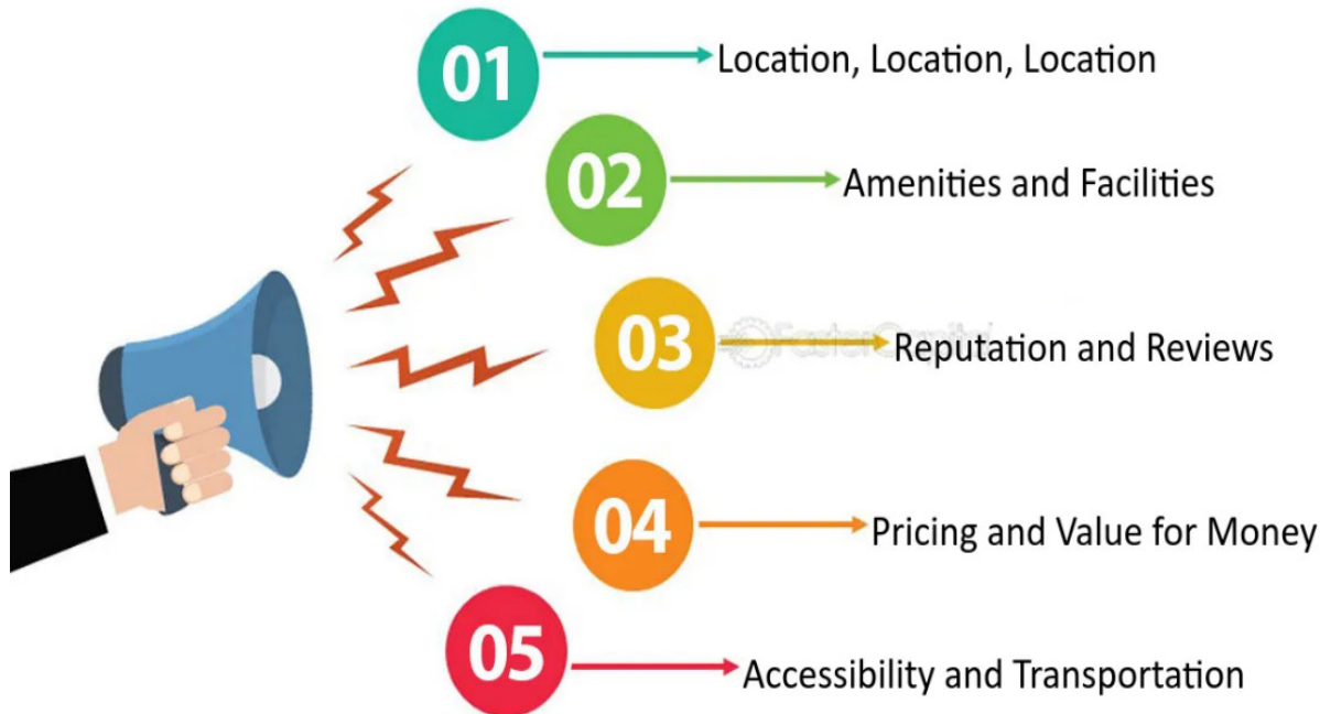
Figure 2. Key factors to consider when choosing a hotel for accommodation trading